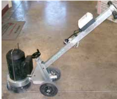
Floor Pro E1 Junior 12" plate

The systems shown here give various cost options to all users of flooring products.