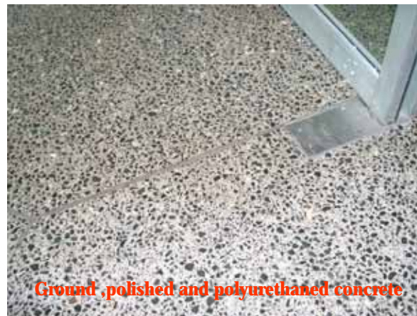
Ground, polished and polyurethaned concrete